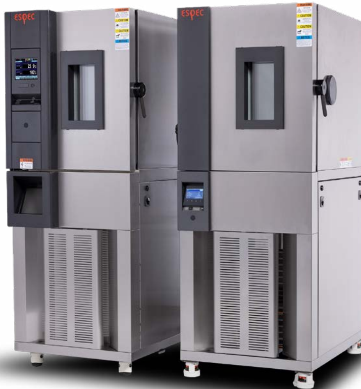
EGNZ4 -5NWL - 30°C/m

Get fast temperature cycling of 15°C/min or 30°C/min in a four cubic foot test chamber