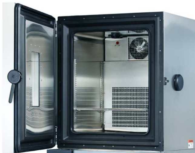
Interior view of BTZ-4200, the EGNZ4-5NWL is similar.

*Change rate per IEC 60068 3-5 with empty chamber, measured at the supply air. Performance assured when room temperature is steady, 18 to 27°C (65 to 80°F).